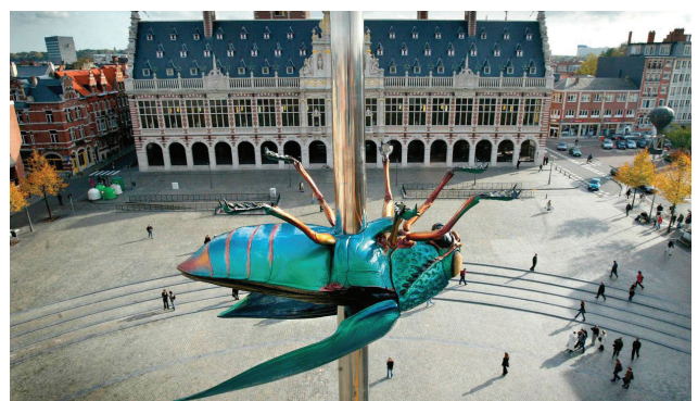
This is Totem by the Belgium artist Jan Fabre. The statue is next to the Leuven University library and represents the collective memory of humankind.

The 10th ECSWR in 2020 will take place in Bucharest, Romania, hosted by the University of Bucharest. The conference theme will be 'Social Work Research: Contributing to Innovations in Practice, Policy and Social Development'.